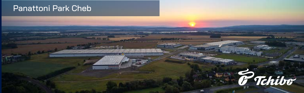
Panattoni Park Cheb

Location: Cheb, Karlovy Vary Region Size: 103,000 sq m