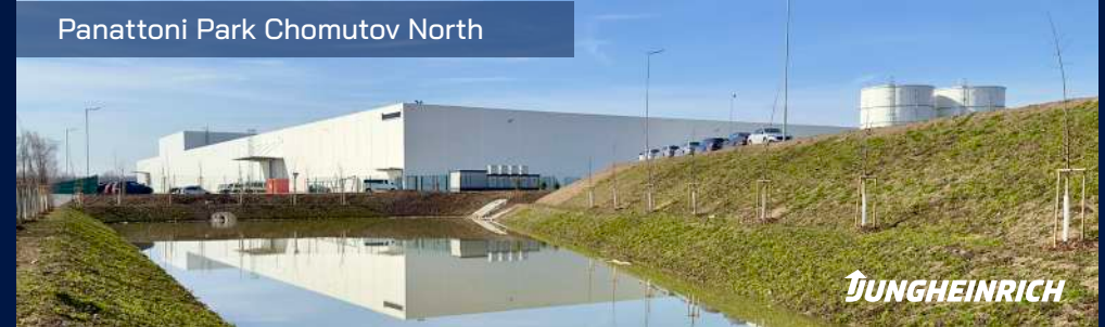
Panattoni Park Chomutov North

Location: Jirkov, Ústí Region Size: 37,000 sq m