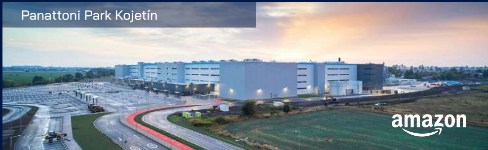
Panattoni Park Kojetín

Location: Kojetín, Olomouc Region Size: 187,000 sq m