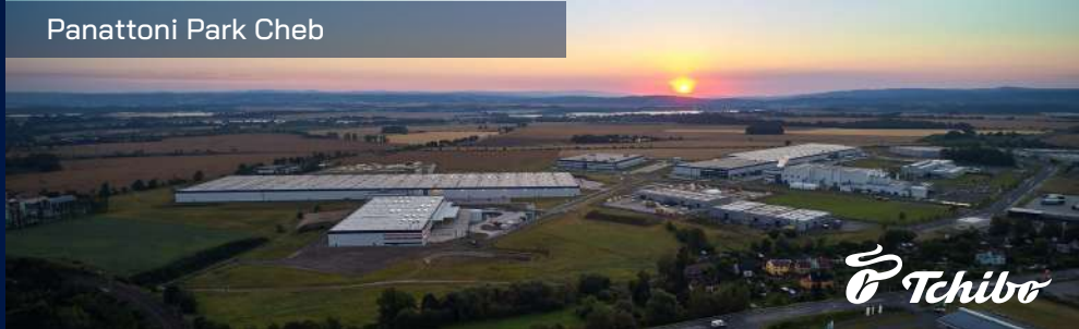
Panattoni Park Cheb

Location: Cheb, Karlovy Vary Region Size: 103,000 sq m