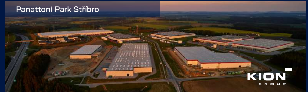
Panattoni Park Stříbro

Location: Ostrov u Stříbra, Pilsen Region Size: 79,400 sq m