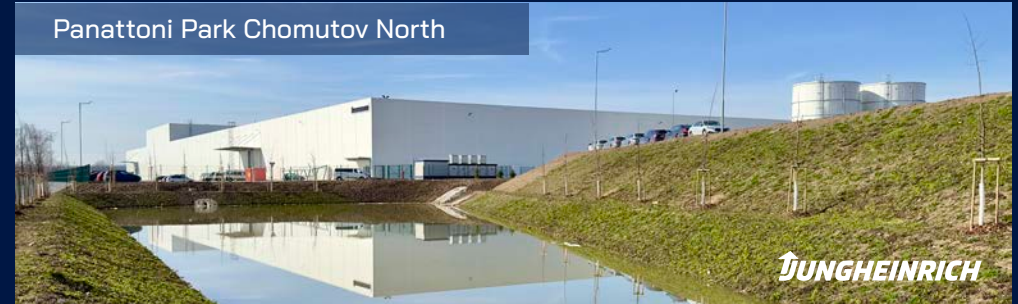
Panattoni Park Chomutov North

Location: Jirkov, Ústí Region Size: 37,000 sq m