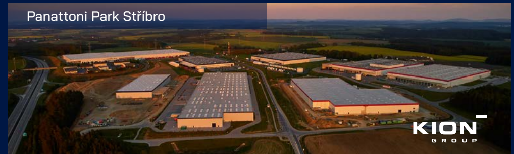
Panattoni Park Stříbro

Location: Ostrov u Stříbra, Pilsen Region Size: 79,400 sq m