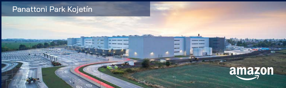
Panattoni Park Kojetín

Location: Kojetín, Olomouc Region Size: 187,000 sq m