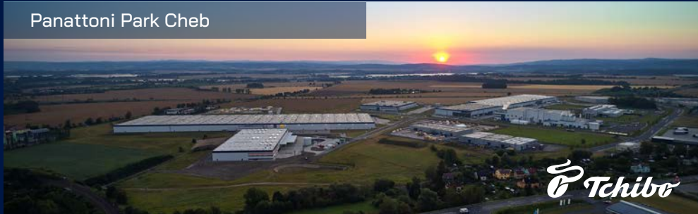
Panattoni Park Cheb

Location: Cheb, Karlovy Vary Region Size: 103,000 sq m